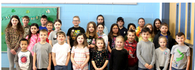
Elementary Students of the Month for February