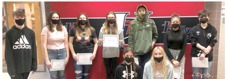
Middle School/High School Students of the Month for December