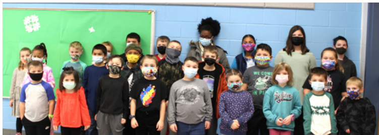
Elementary Students of the Month for December