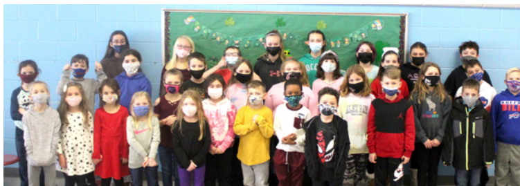
Elementary Students of the Month for January