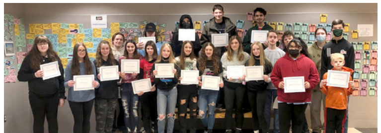
Middle School/High School Students of the Month for January