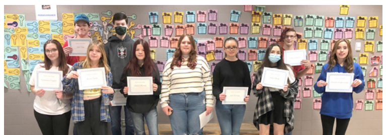
Middle School/High School Students of the Month for February